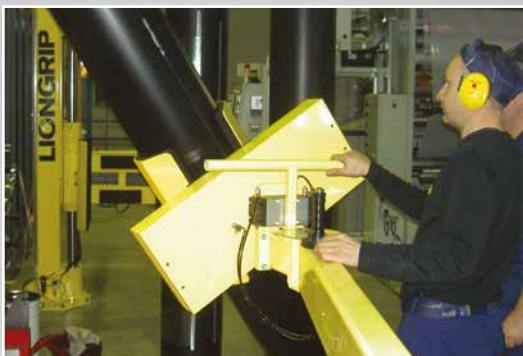
Handling of sleeves.