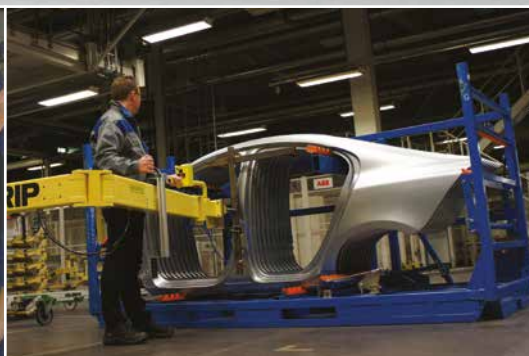
Handling in production lines.