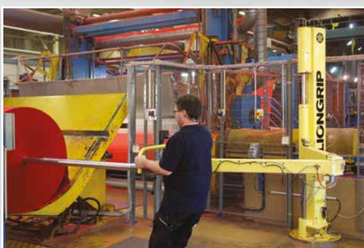
Handling of core shafts.