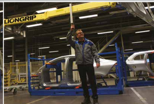
Extra lift height.