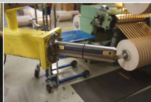
Expanding shaft for lifting reels or sleeves.