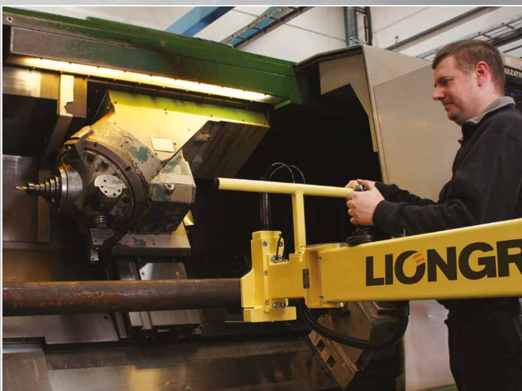
Handling in lathes.